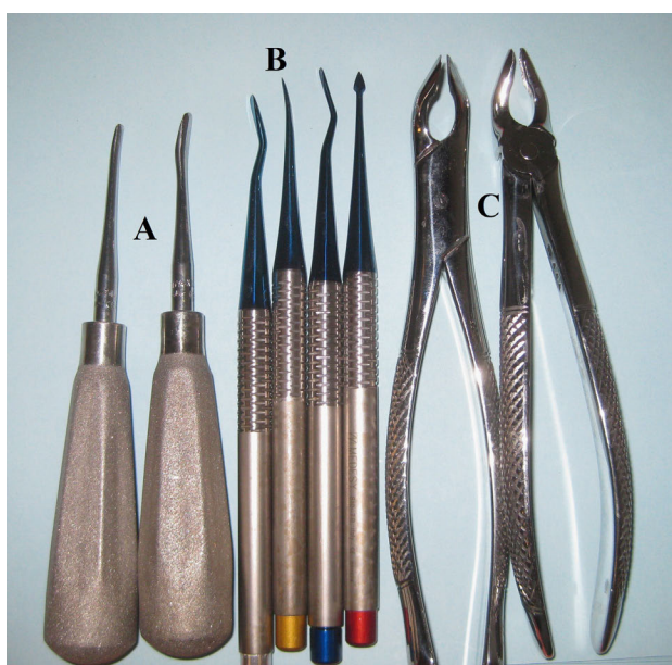
Figure 2. Comparable tools used by dentists and oral surgeons: (A) elevators; (B) root elevators; and (C) universal extractors, lower (left) and upper (right).

2. Anesthesia. After the patient rinses his mouth with chlorhexadine, if available, do a dental block. Supraperiosteal injections, commonly used for